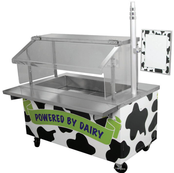
CTI46 shown with optional custom exterior design package, breath guard, and tray slide.